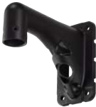
WV-QWL501-B Mount Bracket