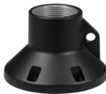
WV-QCL101-B Mount Bracket